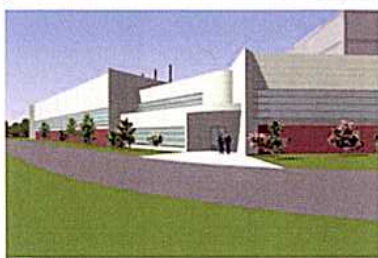
General Utility Plant Fort Belvoir, Maryland