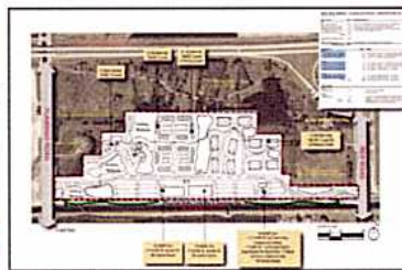
Snake Creek Community, Maryland